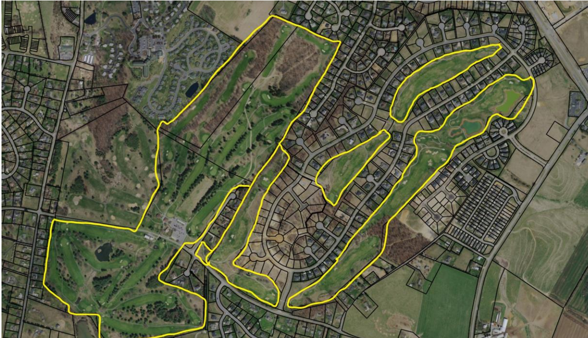
Tax Map Boundaries